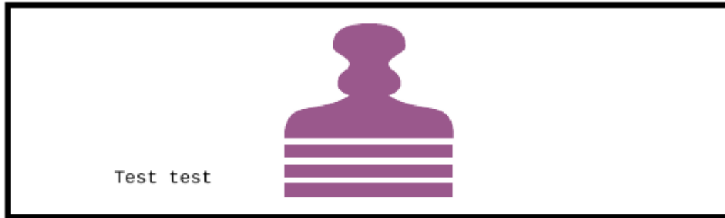
Fig. 2.3: Example of a signature appearance using a stamp imported from an external PDF file.

Note: The external PDF content is imported “natively”: all vector operations will remain vector operations, embedded fonts are copied over, etc. There is no rasterisation involved.