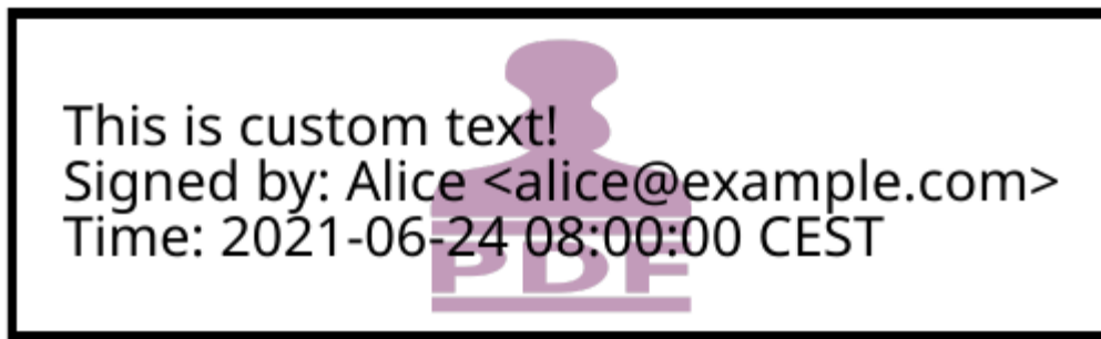
Fig. 2.1: A text stamp in Noto Sans Regular with an image background.