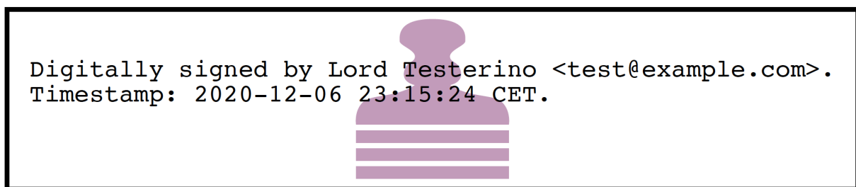
Fig. 1.1: The default appearance of a (visible) signature in pyHanko.

In many cases, you may want to embed extra certificates (e.g. for intermediate certificate authorities) into your signature, to facilitate validation. This can be accomplished using the --chain flag to either subcommand. When using the pkcs12 subcommand, pyHanko will automatically embed any extra certificates found in the PKCS#12 archive passed in.